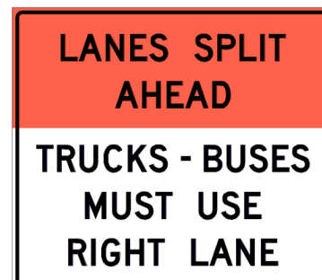
Sign to be posed prior to the bridge